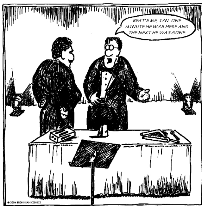
Orchestral percussion instruments: the Brazilian woodblock, the Peruvian cowbell and the Bermuda triangle