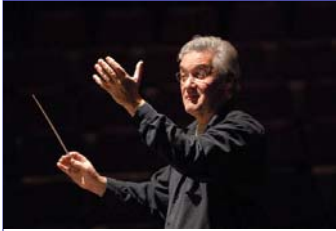
Sunday, November 12, 2006 NAC Orchestra Music Director Pinchas Zukerman leads an acoustic rehearsal at the Auditorium Dufour prior to the Quebec Tour's opening concert in Chicoutimi.